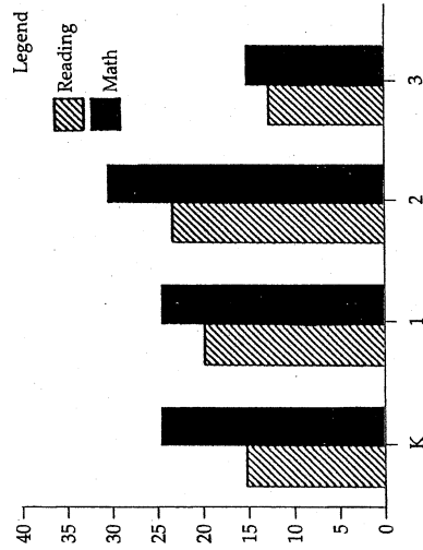
Figure 2. Effect sizes by grade for the cohort of students in the project all 4 years (n~2000); small classes compared to regular classes